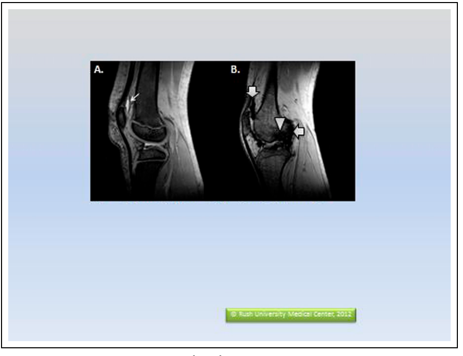
Figure 3. Magnetic resonance images (MRIs) of the knee. A. Normal MRI of the right knee. The arrow indicates a small effusion. B. Abnormal MRI of the right knee. There is hemosiderin-laden synovial hyperplasia (arrows) extending into the central joint space. There are subchondral cysts (triangle) and destruction of the articular cartilage. There is marrow edema within the patella and a subpatellar effusion.

Before the 1980s factor concentrates were prepared from thousands of donors and pooled. The contamination with virus of pooled preparations was common. Patients with hemophilia were at risk for acquiring blood-borne disease, especially human immunodeficiency virus and hepatitis B and C. Starting in 1985 the pooled factor preparations have been treated with heat or solvent detergent, which led to the elimination of the viral contamination risk. Decades ago, the leading cause of death in patients with