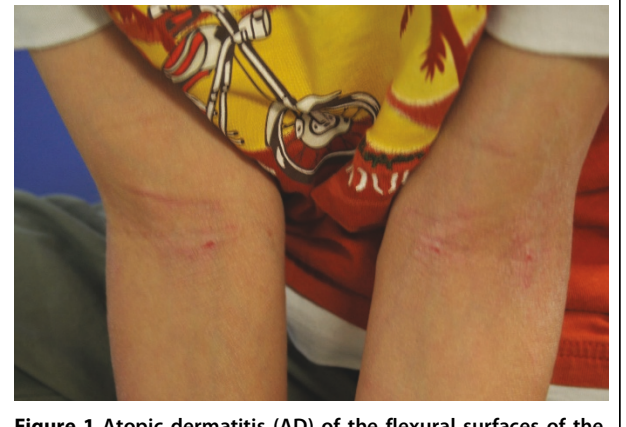
Figure 1 Atopic dermatitis (AD) of the flexural surfaces of the extremities.

Watson and Kapur Allergy, Asthma & Clinical Immunology 2011, 7(Suppl 1):S4 http://www.aacijournal.com/content/7/S1/S4