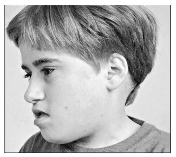
Fig. 2: Partial lateral photograph of patient 2 showing the underdeveloped malar region, the philtrum running parallel to the nose and an everted lower lip, which are all characteristic of Smith-Magenis syndrome.

The eating history, bifrontal narrowness and small mouth raise the possibility of Prader-Willi syndrome, but the height, head circumference and hand size are against the diagnosis. Although Brushfield spots are associated with Down's syndrome, they are common in the general population, there were no other findings of Down's syndrome mentioned and the G-banded karyotype was normal. The clue was the initial karyotype that was reported as being normal, but with a 14p+ variant not found in the parents. True variants tend to be stable and transmitted from a parent. The geneticist ordered a repeat karyotype. The 14p+ was not typical of the usual normal variant; whole chromosome painting was requested and showed that the large "p" arm of chromosome 14 was caused by translocated material from chromosome 20 (Fig. 1A). Specific subtelomeric probes showed its origin was the short arm of chromosome 20 (20p) (Fig. 1B), and the child was thus trisomic for part of chromosome 20p, which accounted for his mild dysmorphic signs and moderate developmental delay. The parents were relieved to finally have an explanation and the extended family was informed that other family members were not at risk of having similarly affected children.